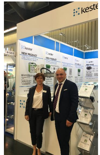
Kester booth at SMT Hybrid Packaging.